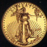
One Ounce Gold Silver