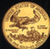
One-Half Ounce Gold Reverse