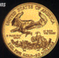
One Ounce Gold Reverse