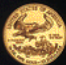
One-Quarter Ounce Gold Reverse