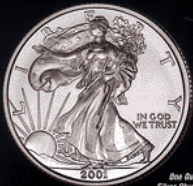
One Ounce Silver Obverse