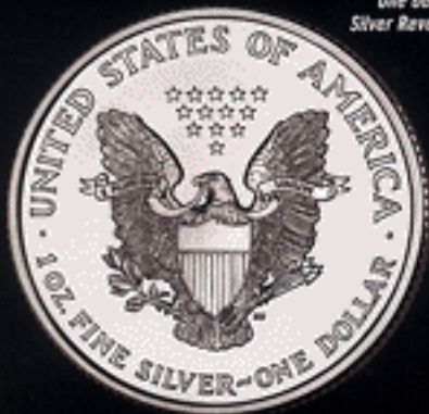
One Ounce Silver Reverse

* Balance of silver bullion consists of copper. Coins shown are not actual size.